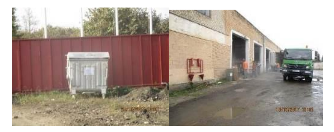
Contaminated Soil Stripped and Stored in the Hazardous Waste Storage Shelter