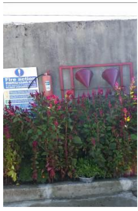
Zug-01: Ingiri Weel Fileds