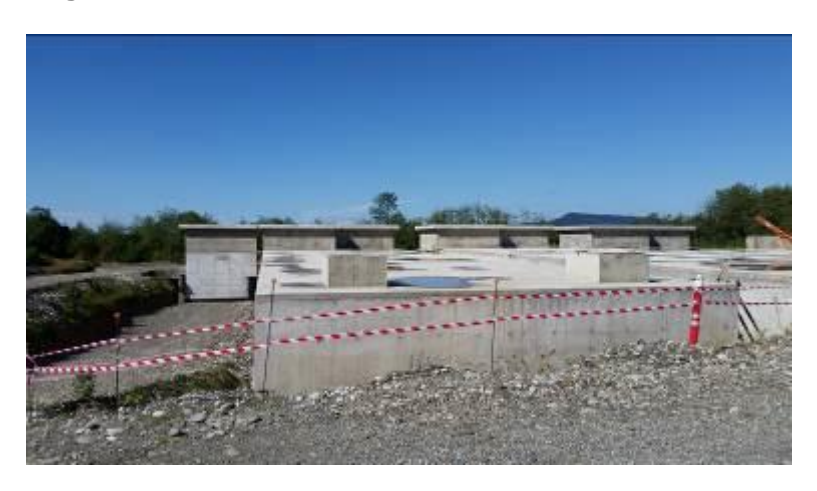
Zug-01: Bashi Reservoir