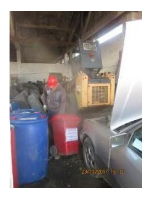
Ingiri Pumping Station Construction Site