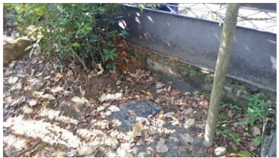
New manholes in the street of Zugdidi and private yards