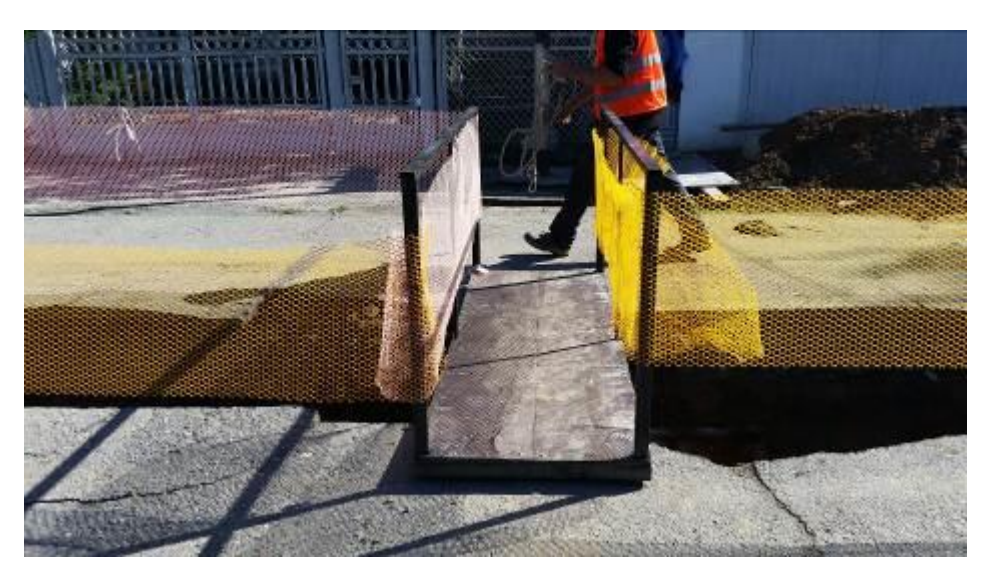
Rehabilitation of Sewerage Network in Asatiani street in Zugdidi