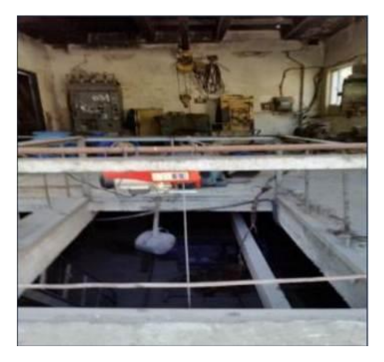
Chi-01: Lezhubani existing Reservoir