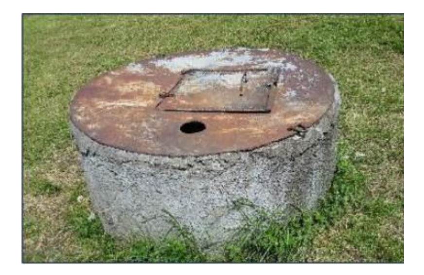
Chi-01: Perevisa exsiting reservoir