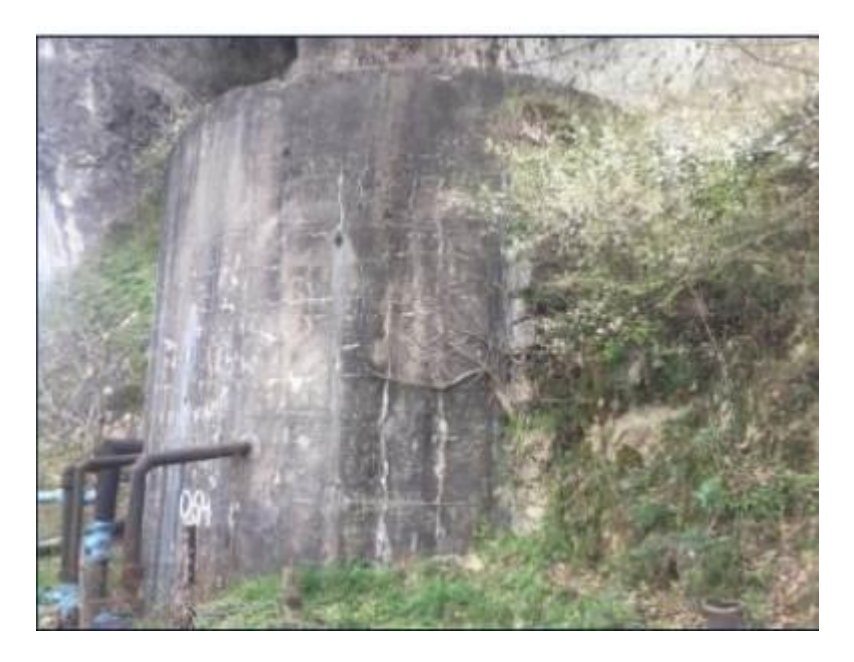
Chi-01: Memorial Exisitng Reservoir