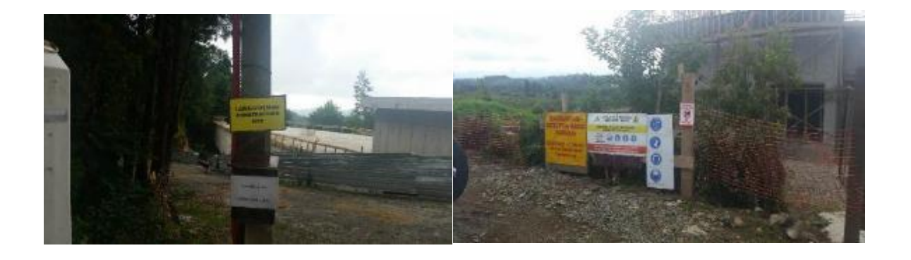
ANNEX C: Non-Conformance Notices