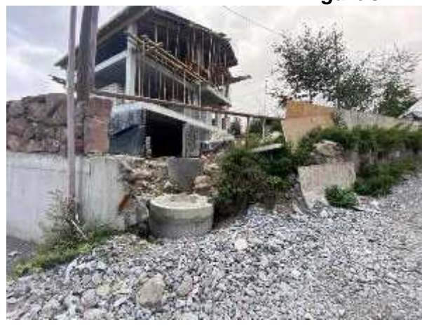
Figure 3: Photos of Site Visit