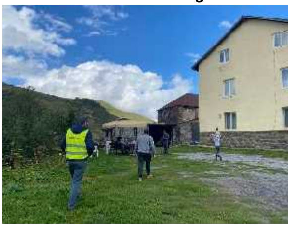
Figure 2: Photos of Site Investigation